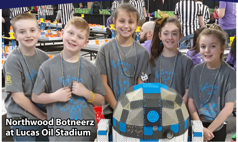
Northwood Botneerz at Lucas Oil Stadium

MHS Business Professional of America members took part in the state conference March 10-12.