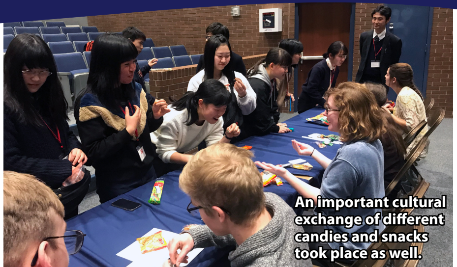
An important cultural exchange of different candies and snacks took place as well.

Due to space limitations, school administrators ask that parents and guardians only attend this event. Students will take part in an orientation during the school day later this spring. The presentation will be held in the PHMS main gymnasium. Please enter the school through door 14, 15, or 16. Staff will be in the hallways to guide parents to the meeting. For information, call PHMS at 317-831-9208.