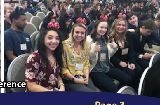
MHS BPA members at their state conference