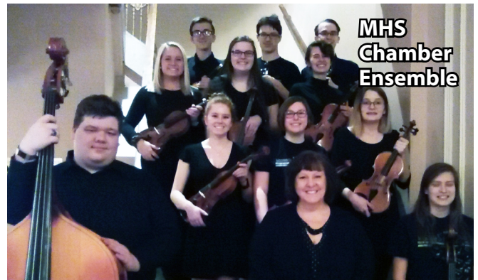
MHS Chamber Ensemble