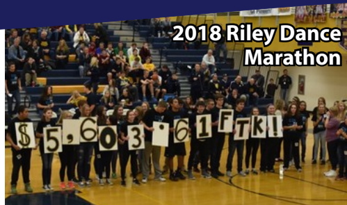
2018 Riley Dance Marathon

from 2:45 – 8:00p.m. This event is open to all high school students, and the cost is $10 to attend. The event serves as a fundraiser for the Riley Children’s Hospital and as a celebration for all of the good work the hospital has provided in our community. Students will hear from Riley families, play on inflatables, learn the “Riley dance”, eat plenty of food, make crafts, and much more. Members of the community are welcome to donate to the school’s total by visiting the Mooresville Dance Marathon webpage . All donations go directly to Riley. Students can pick up registration packets from the high school office or from the Riley table in the cafeteria.